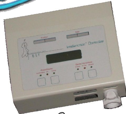
Intellimotion ® Controller

Airbrush ® control and power packed into a compressed ergonomic design perfect for both small and large volume liposuction.