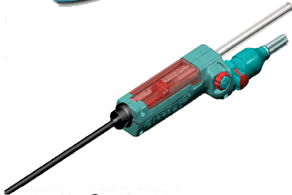
Airbrush ® Liposculptor II

Airbrush ® control and power packed into a compressed ergonomic design perfect for both small and large volume liposuction.